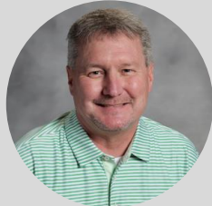
Eric Nelson High School Science