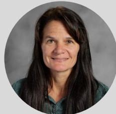
Jaime Robinson Elementary STEAM